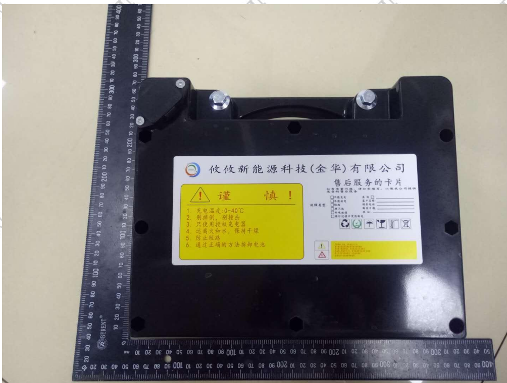
Figure 2 Overall view II of battery (外观图II)