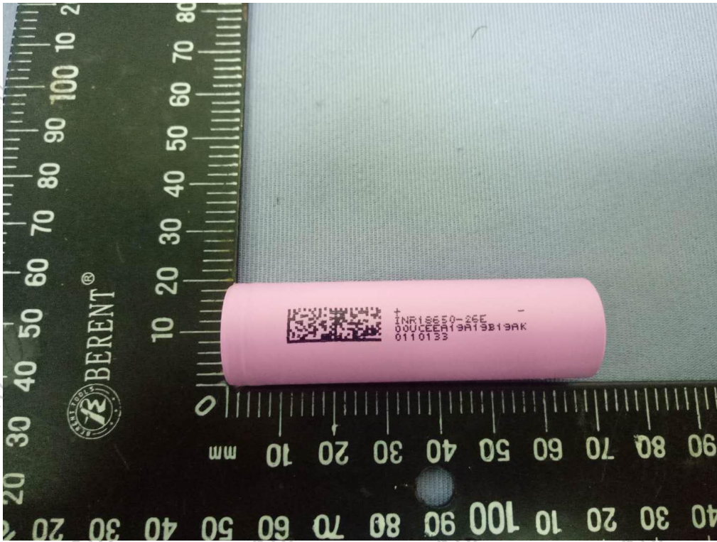
Figure 5 Battery Label (电池标签)