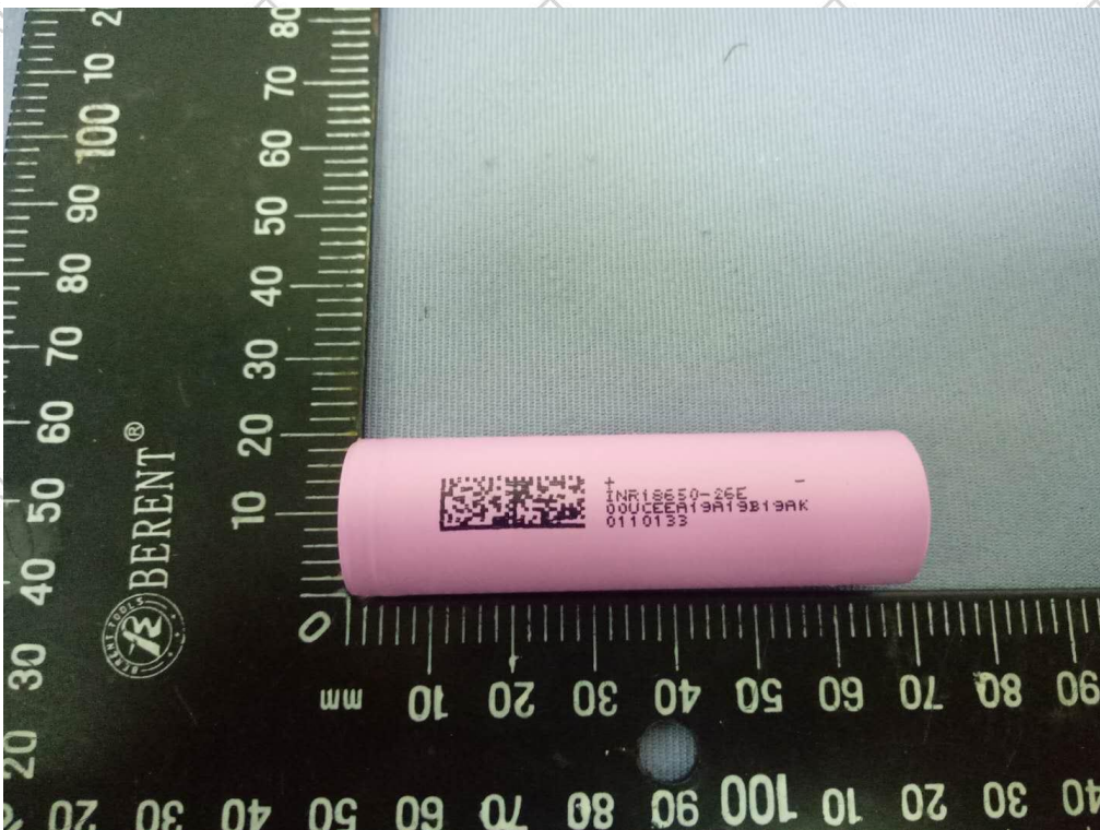
Figure 4 Overall view of cell (电芯图)